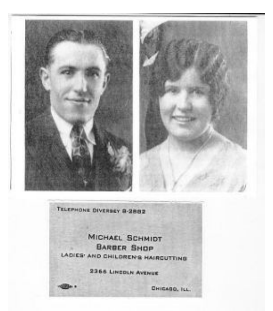
Figure 1. Dad and Mom in 1929.

now a very exclusive, expensive and updated neighborhood with mainly young people. It looks similar to some of the updated parts of San Francisco where they attempt to keep the original architecture.