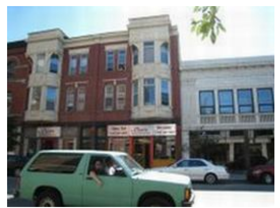
Figure 2. Dad's barber shop on left.

Site Locations. My dad's barber shop (Figure 2) was located at 2366 N. Lincoln Avenue several shops down from the stone