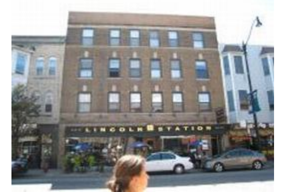
Figure 9. Building across the street from Biograph where FBI agents hung out.

At the morgue they rolled out his body to be identified on a slab. My