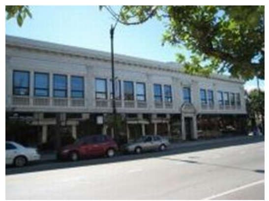
Figure 3. Lincoln Avenue side of stone laced building.

from WWI he had shell shock. My dad said: "The only time he