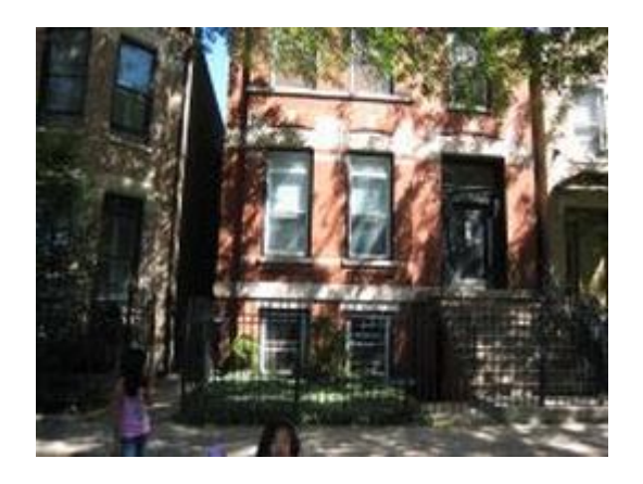
Figure 10. Updated typical three flat building on Howe Street.

My dad was driven in a cop car to the see dead men at the Saint Valentine's Day killing on Clark Street. The first year of my life we lived on Howe street which was two blocks from Burling Street further south (Figure 10). The three flat on Howe street was located near the 1929 Saint Valentine's Day Killing location on 2122 North Clark Street.