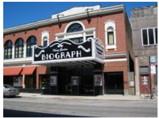
Figure 5. Biograph Theatre.