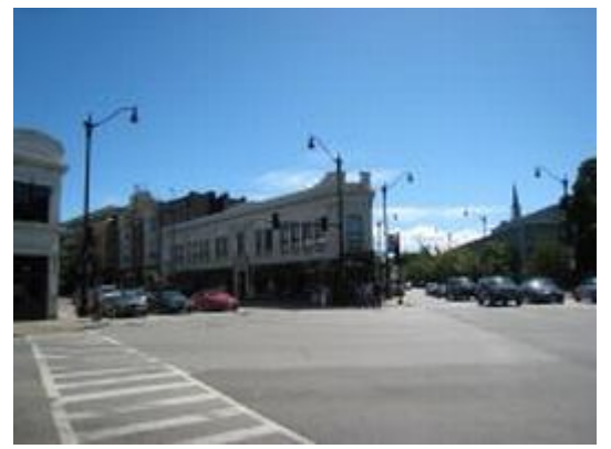
Figure 4. Across the street on the left is where Seminary Restaurant was located.